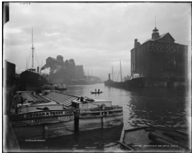
Picture of grain elevators

Students will point out the people on the boat and the elevator and discuss how various jobs were created. (Grain elevator workers)