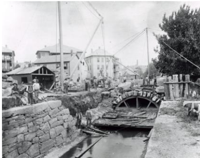
Picture of men working on the canal

http://worcestermag.com/2014/03/06/worcesters-irish-roots/21496