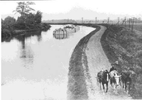
Picture of Erie Canal

http://middleport-newyork.com/middleport-grows-with-erie-canal